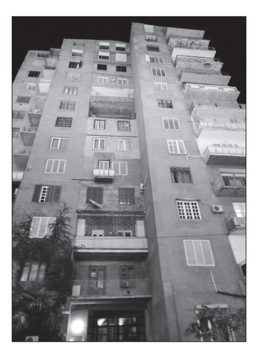
Fig. 3 – Eclectic solutions in a recently built white frame building in central Tbilisi.

both horizontally and vertically (see Fig. 3). The quality of construction is not always reassuring, even though most developers assure that, e.g., the seismic safety of their projects has been verified, either independently or by in-house expert staff. Because the buildings are usually infill developments, there is very little direct displacement. When displacement does occur, it is usually dealt with directly between the developer and the displaced, and some form of compensation, such as an apartment in the new development, is offered. This is facilitated by the fact that an overwhelming share of the housing stock is privatized. 11