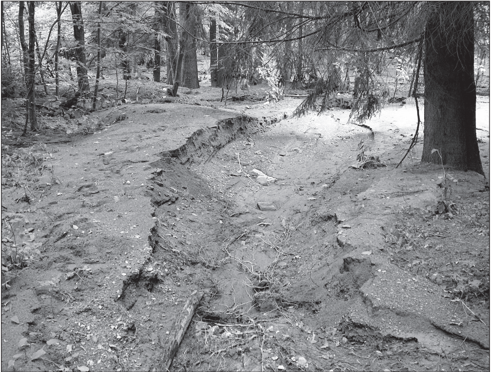
Fig. 2 – During flash flood along the Olešenský potok Brook on June 10, 2004 large amount of material was transported from fields into forest areas. Slopes with maize fields were easily affected by soil erosion during intensive rainfall.